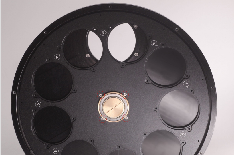
Step3: Release these six screws and remove the default filter wheel adapter.