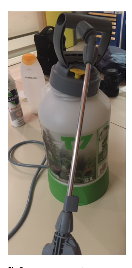
Fig 9. The container used for the cleaning mixture