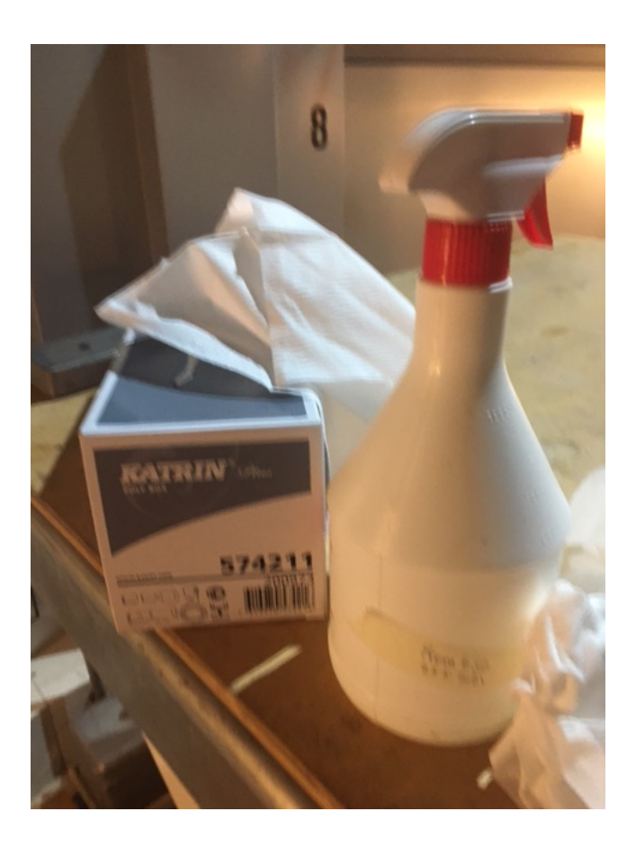
Fig. 4. Paper cloths and sprayer filled with drinkable water. They are located in the mechanical workshop

After this, the water drip from M1 was directed into a defined place: using a white plastic sheet, and a water resistant tape (alias packaging tape), the lower half of the space between the tube and M1 cell was closed, see Fig. 7. An hole in the plastic sheet at the minimum height was practiced and the pipe shown in Fig. 8 was taped in; it is important to be sure that the outlet of the pipe is level with the plastic sheet, otherwise the water will not get out (check from the inside of the tube). A clean bucket was placed below to collect the water and soap from the pipe.