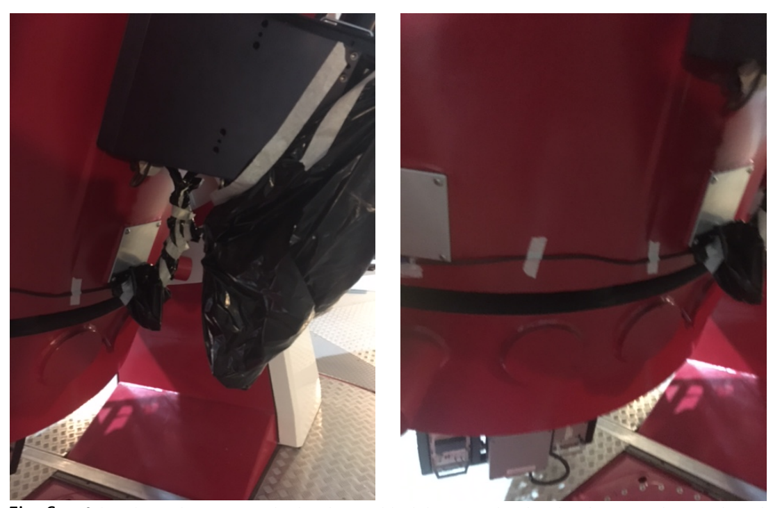
Fig. 6. Left hand panel: PISCO inside the clean rubbish bag; another bag has been used to insulate the dangling wires.

Right hand panel: fixing PISCO wires to the upper part of the telescope