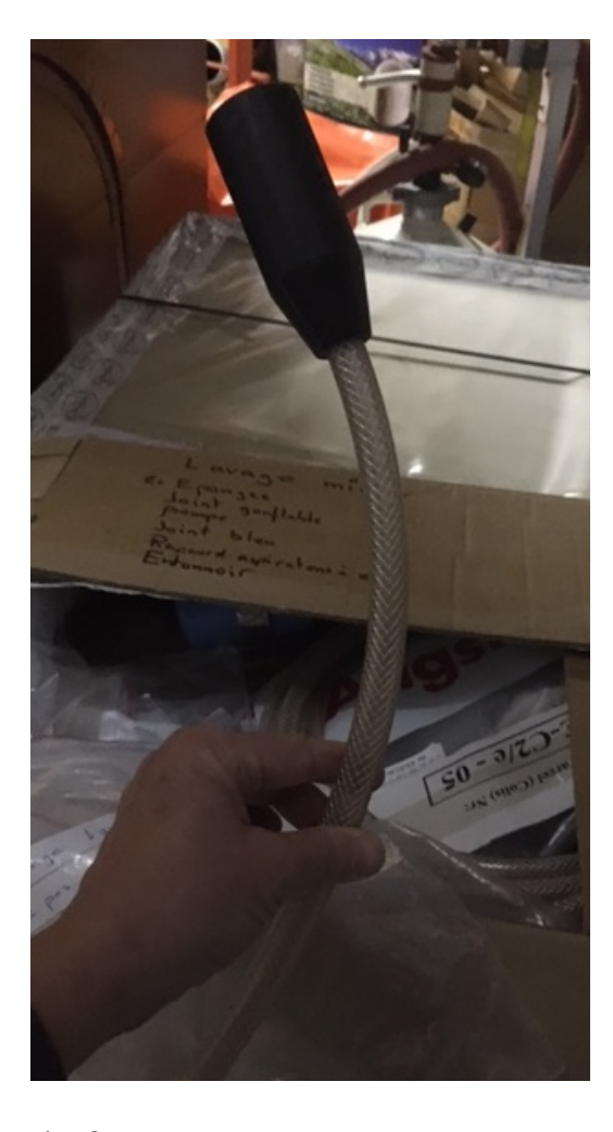
Fig. 8. The small pipe used to collect at the bottom of M1 \,