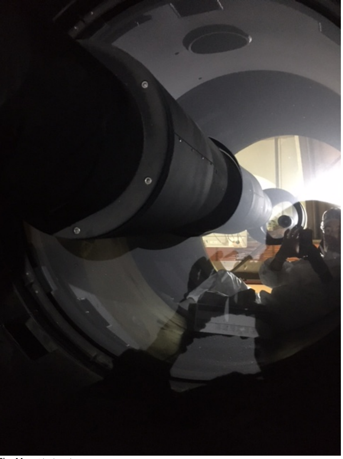
Fig. 11. Inside the tube..