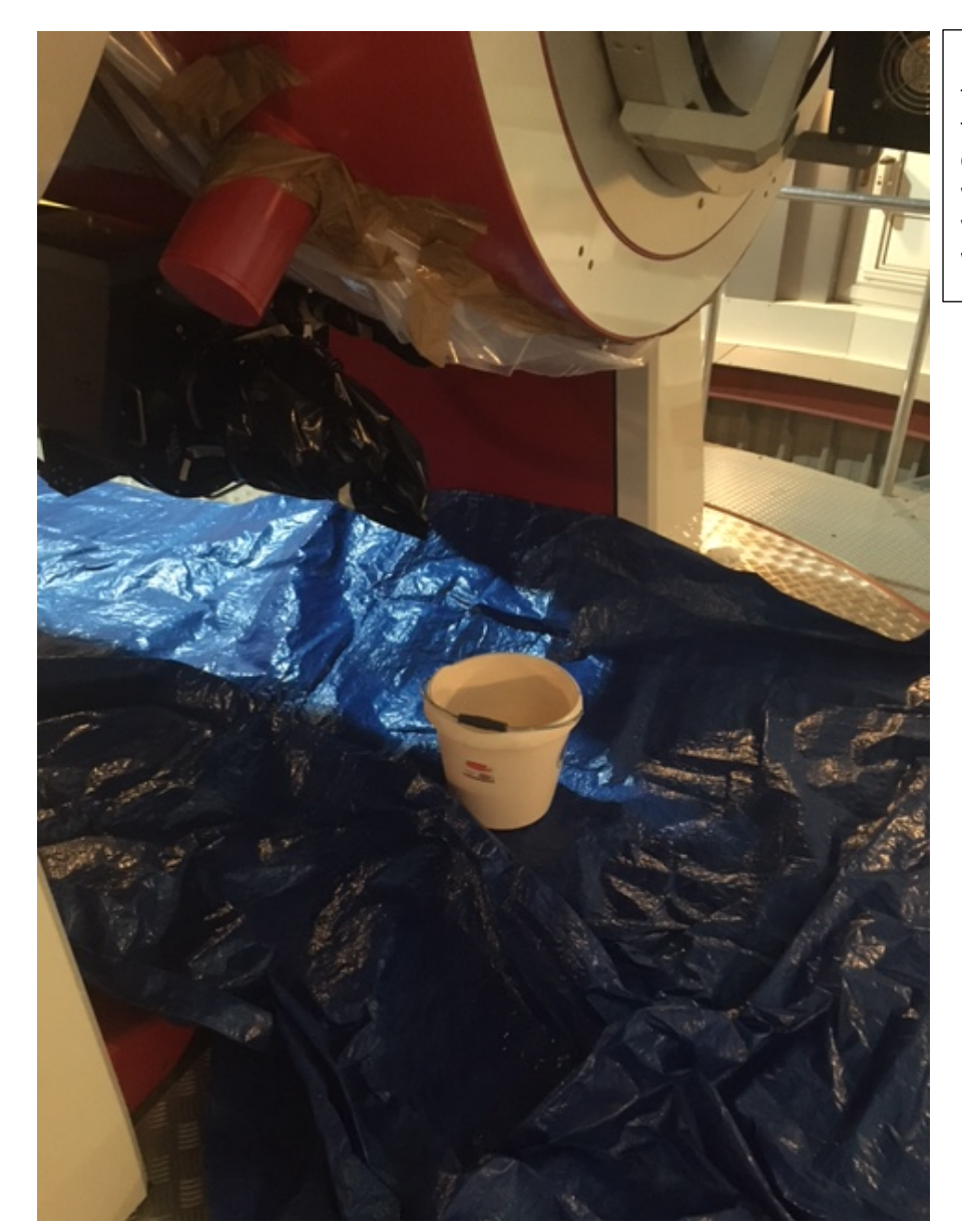
Fig. 7. Closing the lower half of the space between M1 cell and the tube in an attempt to control the direction of the water flow from M1 washing...and to avoid having water inside M1 cell.

Once all the mirror is dry, the reflectivity measure was repeated: