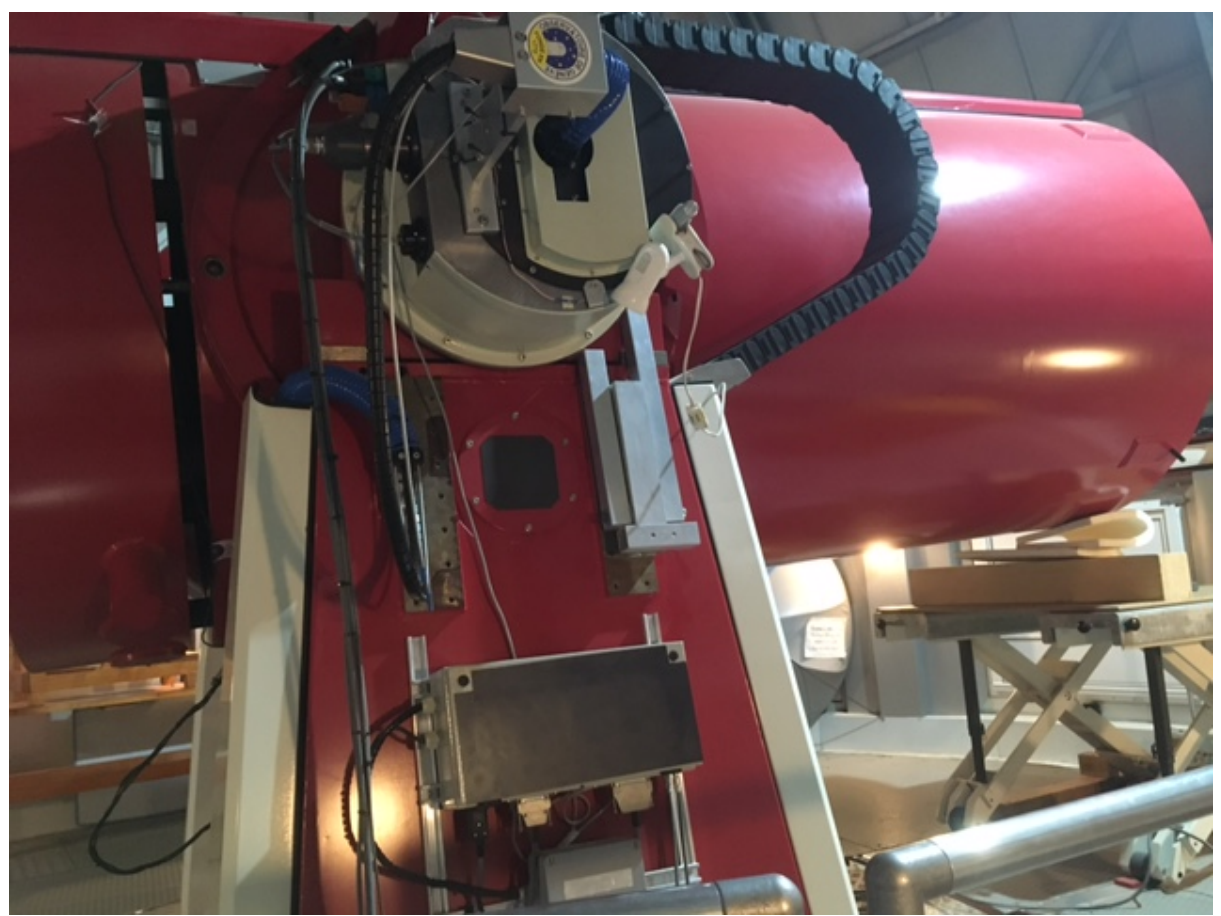
Fig. 3. The telescope is being lowered to the elevating table and the tube will go on top of the white foam visible above the wooden block. The height of the table can be adjusted with the handle located to its left.

stack, covered by a protective white foam sheet to avoid scratching the paint on the tube; the angle with the ground was \sim 5-10 degrees, see Fig. 3.