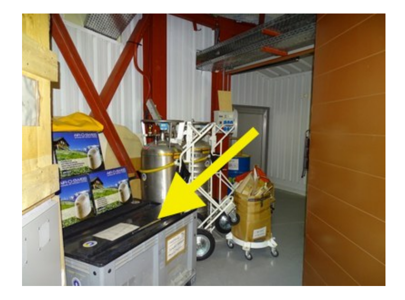
Fig. 1. Box where all the delicate (and not so delicate) items for mirror cleaning are located. Please take care of leaving things clean!! Here you will find the sponges, the special soap, the pipe and the compressed air pistol, the wooden block and the white foam to lower the telescope on, the mixer for the cleaning solution, the bucket and the small plastic pipe.