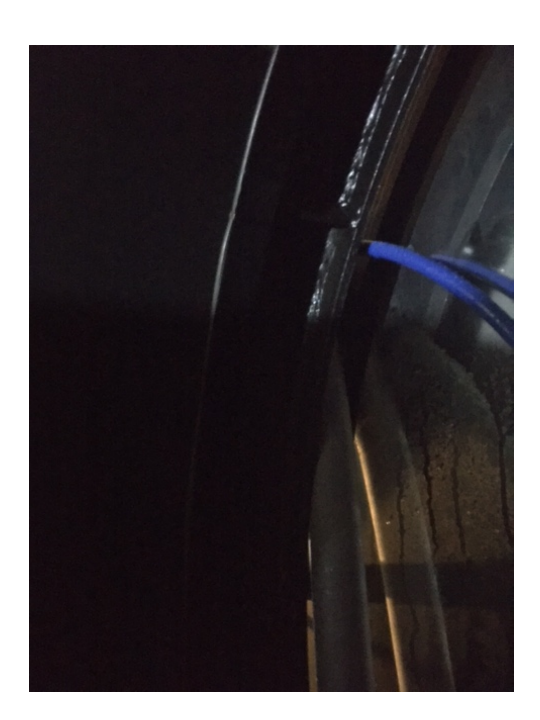
Fig. 10. Here is visible the compressed air pipe (blue one) inside the tube and (barely visible) the grey tube used around M1. Below it, there is the pipe and sprinkler for the cleaning solution