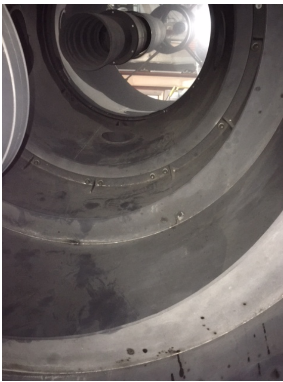
Fig. 5. From top left to top right and bottom left: M2 spider with bird droppings and dust and a view of the M1 and the inside of the telescope tube before the cleaning